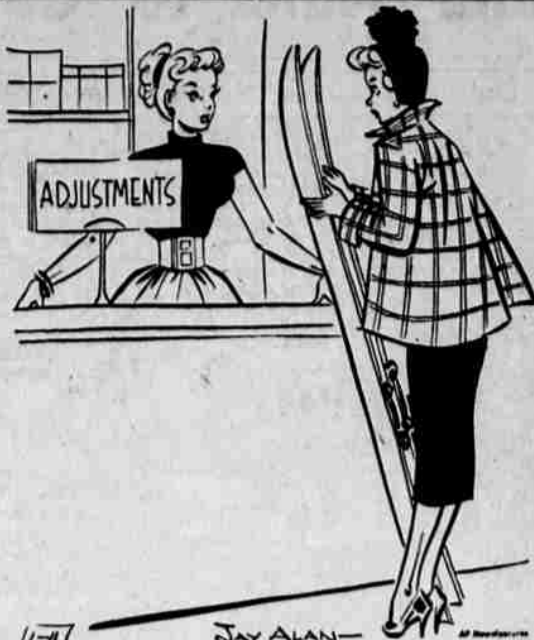
I WANT A REFUND ON THESE, MY ATHLETIC BOY FRIEND AND I BROKE UP SO I DON'T HAVE TO GO SKIING AFTER ALL!