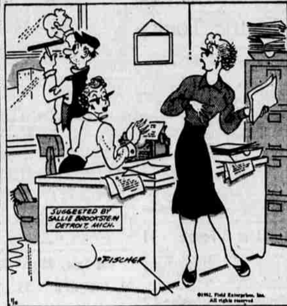
I resent that remark, Hysteria! I'm just as intelligent as you... and goodness knows that's as dumb as they come!