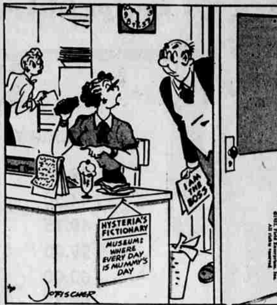
But I do eat breakfast at home, Mr. Wump! This is just a snack to hold me until lunch.