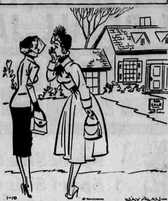
THAT'S OUR DREAM HOUSE, BUT WE'VE GOT TO HAVE ANOTHER DREAM TO FIND OUT HOW TO PAY FOR IT!