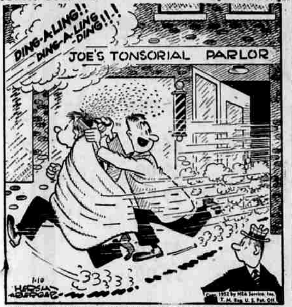
"It's a fire alarm, and he's a member of the volunteer fire department!"