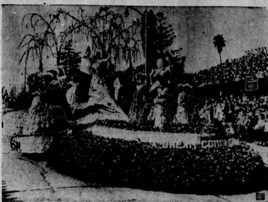
SWEPESTAKES WINNER IN ROSE PARADE —This float, entered by the Southern California Floral association and titled "Every Girl's Dream of the Future," won the sweepstakes award as the best float in the Tournament of Roses at Pasadena. It features a garden wedding scene and is made up of nearly 75,000 flowers.

German invaders completely wrecked the mining towns on the island of Spitzbergen during World War II.