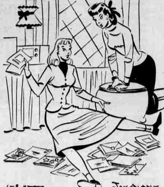
HOLY COW! I SENT OUT FIFTY CHRISTMAS CARDS AND ONLY GOT TWENTY-TWO BACK—I'M LOSING MONEY!