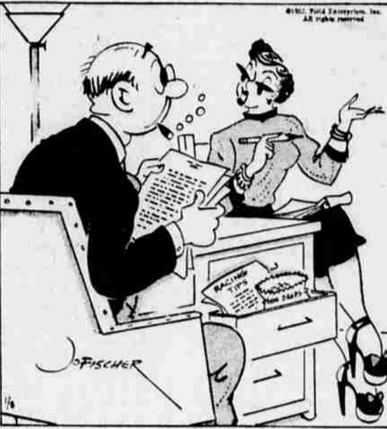
You always say the same thing in your letters, Mr. Wump . . . Why do you confuse me by saying something else?