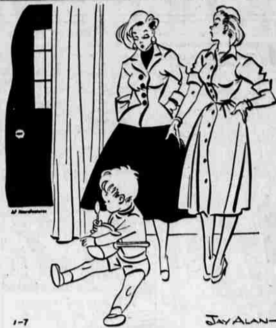
All the beautiful toys he got for Christmas and he still prefers to play with that old tin pan!