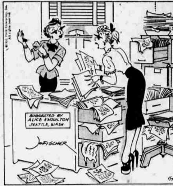
I have a much easier time finding things at home. I just ask my mother.