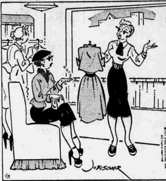
Well... you're a size 12 but our 14's run about size 10... so this 15 should fit you just about right.