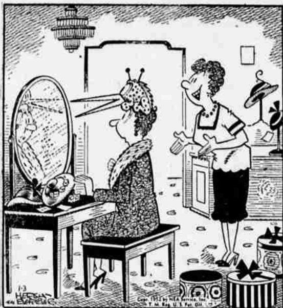
"This is our income tax number—it will scare your husband into the hospital so he can make more deductions!"