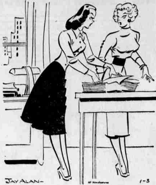
How can I find it if I don't know how it's spelled? What I need is a dictionary that spells words the way I think they're spelled.