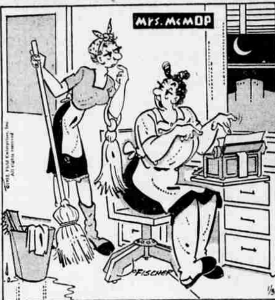
I'm asking for additional remuneration starting next week. Sadie, how do you spell 'week'.