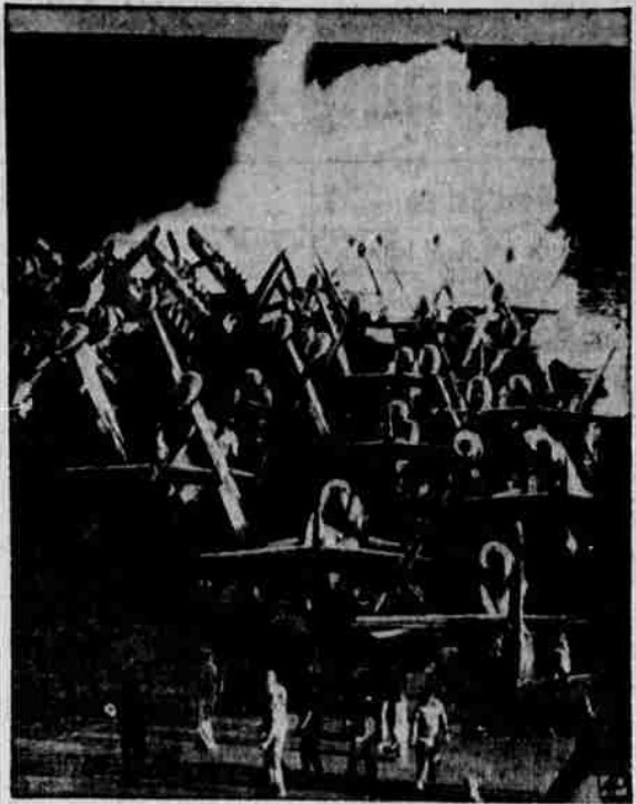
STORMY WEATHER —Men on the flight deck of the aircraft carrier USS Essex turn to watch a huge wave crash over the deck as the vessel ploughs through rough water in the Sea of Japan. Planes operating from the Essex have been striking at Red supply lines and installations in North Korea.