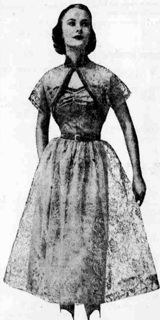
YOUNG PARTY STYLES

Christmas-time Robes to keep her warm all winter. Rayon satins, taffetas, in sweepingly long or swingy duster styles. Some brightened with gala trims, piping. All with rich contrasting linings.