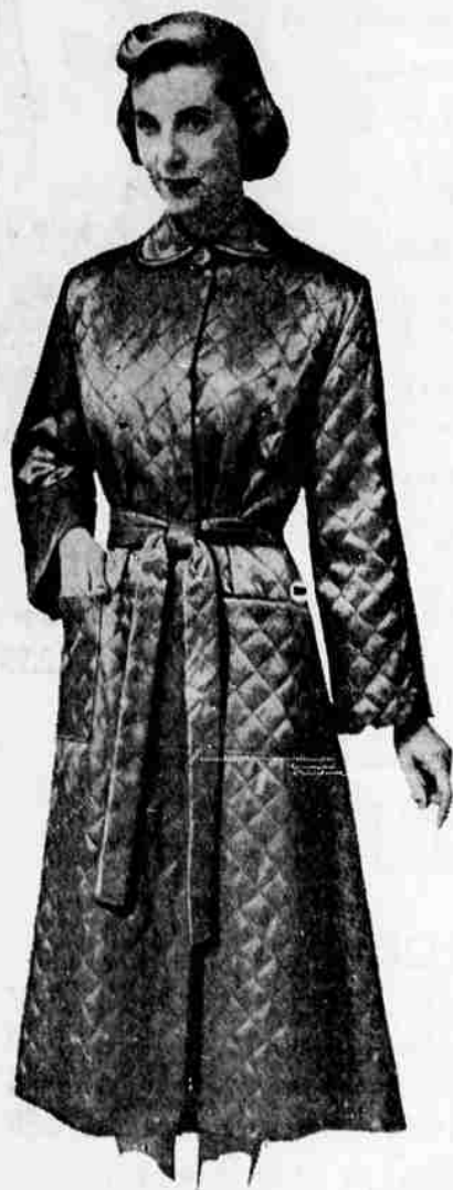
RAYONS IN JEWEL COLORS