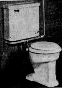
Toilet Tank Tray PREVENT DISCOLORING LOOSENING ROTTING OF BATHROOM FLOORS