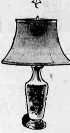
TABLE LAMPS The shining spot in your home will be a new Rembrandt table lamp. See our newly arrived selection from the world's outstanding designers. New thrilling colors and shades. Economically priced.

WORLD'S ONLY PRESSURE-TESTED, AROMA-TIGHT CEDAR CHEST. GUARANTEED MOTH PROTECTION UNDERWRITTEN BY ONE OF WORLD'S LARGEST INSURANCE COMPANIES.