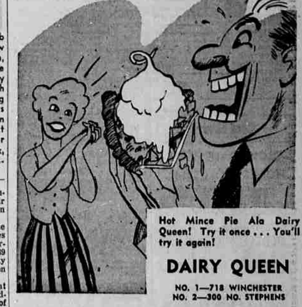
Hot Mince Pie Ala Dairy Queen! Try it once . . . You'll try it again!

DAIRY QUEEN NO. 1—718 WINCHESTER NO. 2—300 NO. STEPHENS