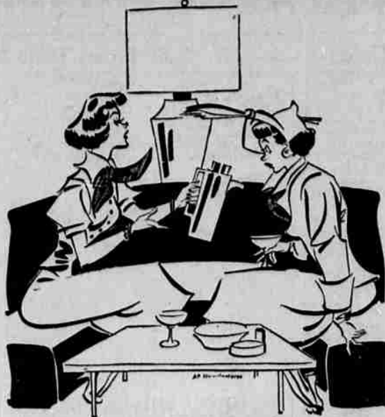
IT'S A NEW COCKTAIL I INVENTED, YOU TAKE THREE PARTS 12 YEAR OLD SCOTCH AND ADD TWO PARTS 10 YEAR OLD SCOTCH!