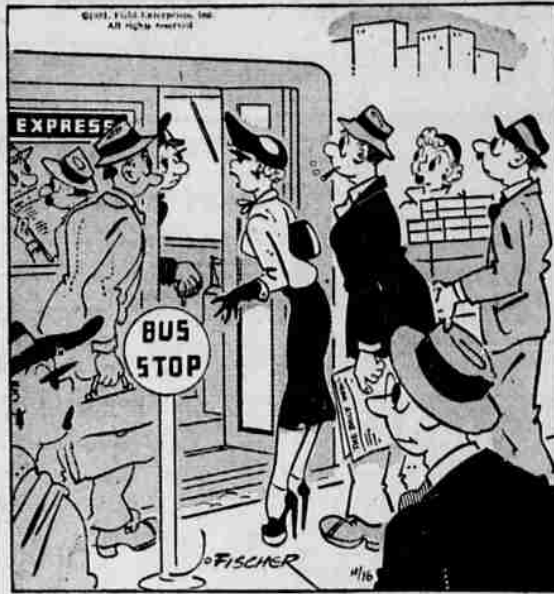
Would you wait about ten minutes for my girl friend . . . you know, the one who always misses this bus?