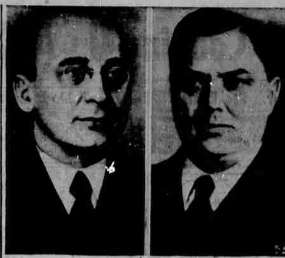
POWER TWINS OF POLITBURO —Lavrenty Beria (left) and George Malenkov (right) are believed to have new authority in Russia, on the basis of between-the-lines hints from Moscow. The impression is given that Stalin has relinquished at least some of the active control on his Soviet dictatorship. Beria is head of the vast police system of the world's biggest police state. Malenkov, a protege of Stalin, controls the Communist party apparatus.