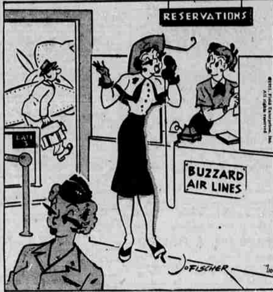
By Al Capp