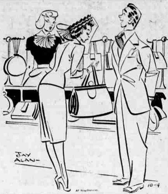
Will bet you could get one even larger than that if we tried the luggage department!