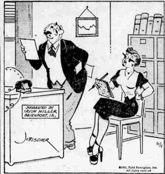
Would you please repeat that, Mr. Wump? I'm afraid I got it right the first time.