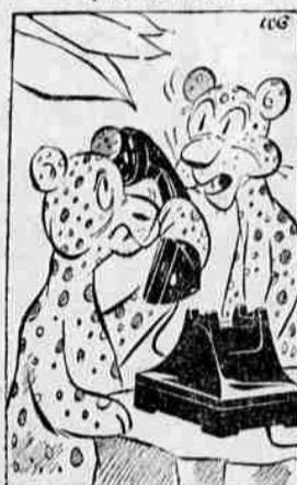
"Give Dopey plenty of time to answer. He's busy today—someone sent him a bottle of spot remover!"... You'll complete more calls if you give the other person time to answer—at least a minute... Pacific Telephone.