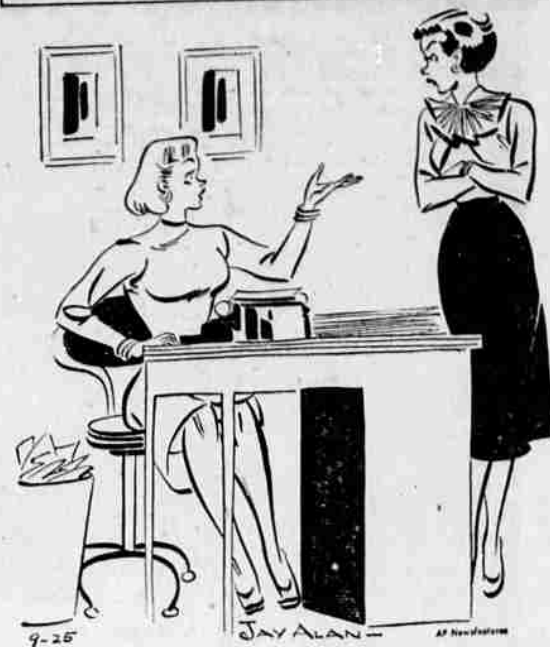
I'M WRITING A BEST SELLER. I SEE NO CENSE IN WRITING A BOOK NOBODY BUYS ! II