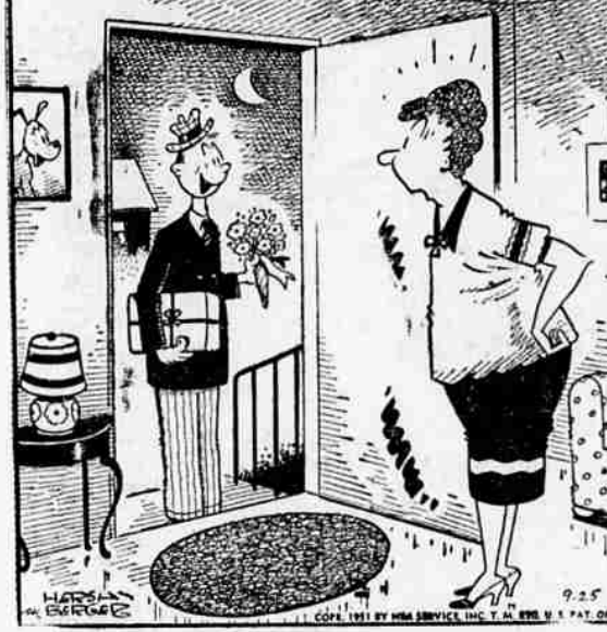
"Need a sitter for any 16-year-old girls?"