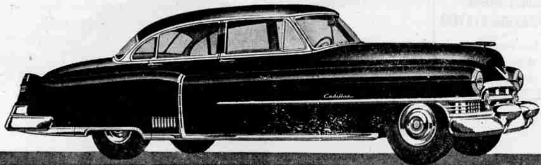
Standard equipment, accessories and trim illustrated are subject to change without notice.

Right at this moment, there are thousands of people in America who are just about ready to end all compromise insofar as motor cars are concerned—and order a Cadillac.