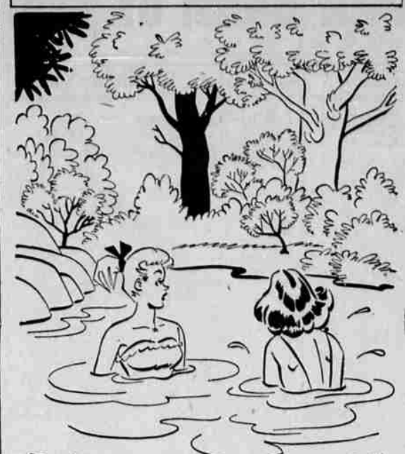
JAY ALAN - AP Wirephoto B-24 LET'S STAY IN A FEW MORE HOURS. A MAN ALWAYS SHOWS UP WHEN GIRLS GO IN SWIMMING IN THE MOVIES!