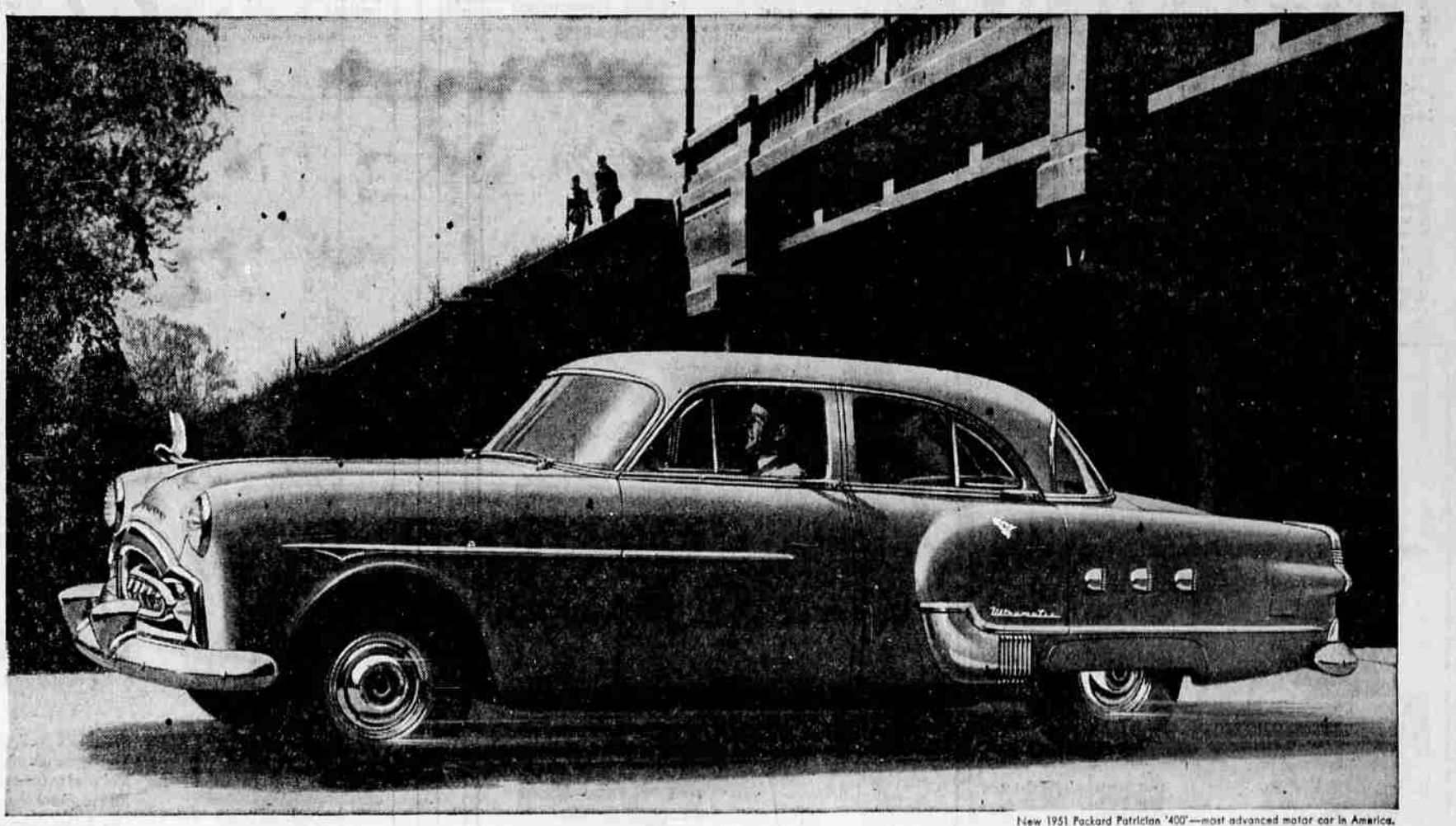
New 1951 Packard Patricia '400'—most advanced motor car in America. Car details as shown subject to change without notice.

Drive at least two new cars, this time, before you decide to buy—and be sure one of them is a new 1951 Packard! And why do we issue this challenge? The two best reasons in the world: 1 Until you drive a new 1951 Packard, you just don't know what's been happening in the automotive world. That's something you owe yourself! 2 The best advertising is "word-of-mouth" advertising. Whether or not you buy a Packard, it's to our advantage to start you talking about the advancements that make Packard the newest new car of the year. That's something we owe ourselves! P.S. We know from experience that today's most thoughtful buyers will gladly accept this challenge.