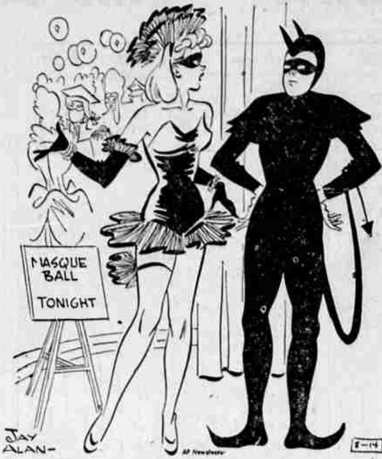
WHY, ALBERT, I'D RECOGNIZE YOU ANYPLACE IN THAT COSTUME!