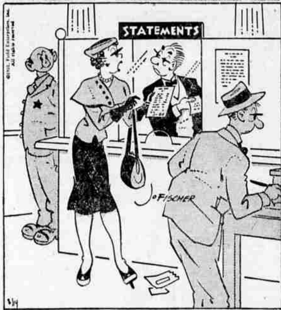
Something's wrong. Your figures say I have nothing in my account and mine show I have two dollars less.