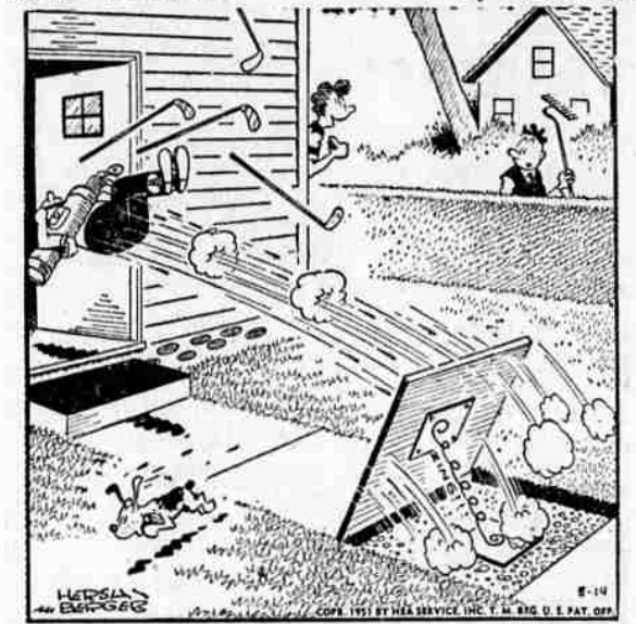
"It's a hidden springboard—when George sneaks out for golf instead of mowing the lawn, I just push a button!"