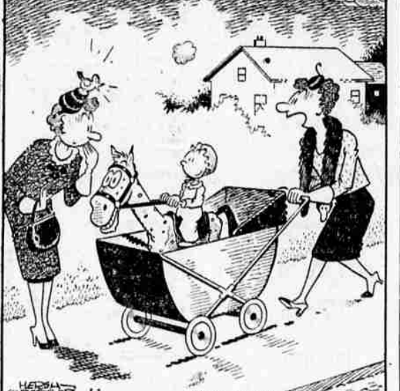
"His grandparents had him for a week and this is one of their ideas!"