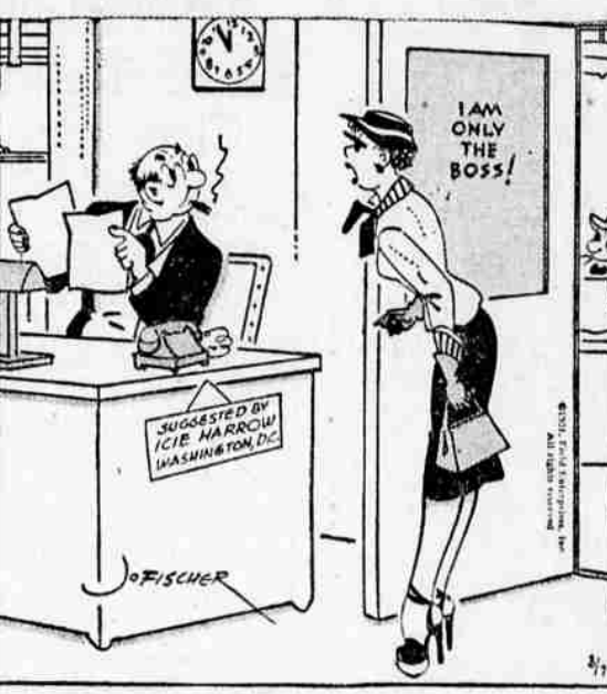
I'm taking two hours for lunch, Mr. Wump. I've been so busy all morning, I didn't have time to go out for breakfast.