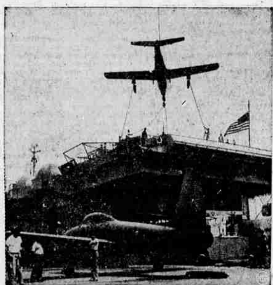
JETS FOR EUROPE —Thunderjet fighter planes, bound for Atlantic Pact nations under the Mutual Defense Assistance Program, are hoisted aboard the USS Corregidor at Fort Newark, N. J. The jets will add punch to the air and ground team General Eisenhower is building for defense of Western Europe.

When you travel East, you'll find it a happy choice to go Union Pacific. You'll rest as you ride... enjoy wonderful dining-car meals, home-like lounges, comfortable Pullman and coach accommodations. Go UNION PACIFIC... it's the pleasant way East. Three fine trains daily to and from the East Streamliner "CITY OF PORTLAND" "PORTLAND ROSE" "IDAHOAN" We'll help plan your trip Ask for beautifully illustrated booklet on "VACATIONS EAST" GENERAL AGENT 201 Ardel Office East 10th Avenue Eugene, Oregon — Phone 5-8461 FOR DEPENDABLE TRANSPORTATION... Be Specific... Say UNION PACIFIC