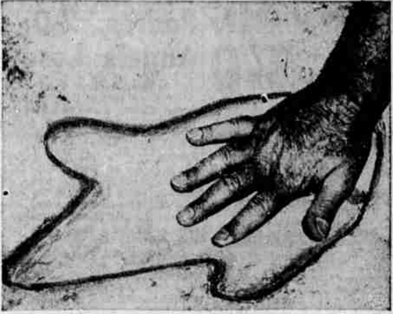
ON THE SANDS OF TIME —Recently discovered in the rocky hill country along the Guadalupe River near Kerrville, Tex., were huge dinosaur tracks like that pictured above, dwarfing a man's hand. It was made, some millions of years ago, by a monster called Tyrannosaurus Rex, fiercest and most terrible of the prehistoric animals. From 40 to 50 feet long and 18 feet high, it was a carnivorous killer with a melon-shaped head that was mostly mouth and sharp teeth. As seen in sketch, below, it walked erect, supported by its huge alligator-like tail and used its comparatively small and weak forelegs for grasping its prey.