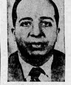
FRED MORRIS FINE

Fred Morris Fine, secretary, public affairs department, national headquarters of the Communist party, USA, is being sought by the federal bureau of investigation on a charge of conspiracy to advocate the violent overthrow of the government. The FBI has requested alert citizens and law enforcement agencies to assist in locating Fine. A description of Fred Morris Fine is as follows: Age, 37; born March 30, 1914, Chicago, Illinois; height, 5'5 1/2"; weight, 130 pounds; build, medium; hair, brown, partially bald in front; eyes, brown; race, white; nationality, American; scars and marks, mole on left cheek at mouth level; distinguishing characteristics, large mouth, heavy features and prominent Adam's apple. Fine has worked as a steel worker, a clothing store clerk, typist and bookkeeper. He is not known to drink. He smokes a pipe and cigars. In the past he has suffered from a hernia and other complications which necessitated medical treatment. He has resided in New York since 1950. Prior to that time he lived in Chicago, Illinois and Detroit, Michigan. He was indicted by a federal grand jury at New York, New York, on June 20, 1951. Any person having information which may assist in locating Fine is requested to immediately notify the nearest FBI office. The phone number appears on the first page of the telephone directory.