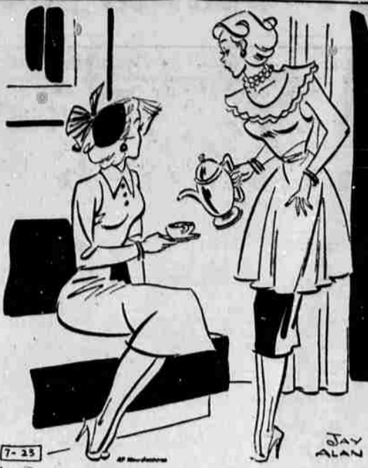
MY DEAR, THERE'S NOTHING LIKE BEING SINCERE, WHETHER YOU MEAN IT OR NOT!