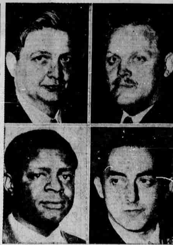
THEY FAILED TO APPEAR —These four convicted Communists who failed to appear in New York for commitment to prison are the object of a huge FBI manhunt. By failing to appear they forfeited their bonds of $20,000 each. Left to right, top; Robert G. Thompson, Gus Hall. Bottom, left to right; Henry Winston and Gilbert Green.