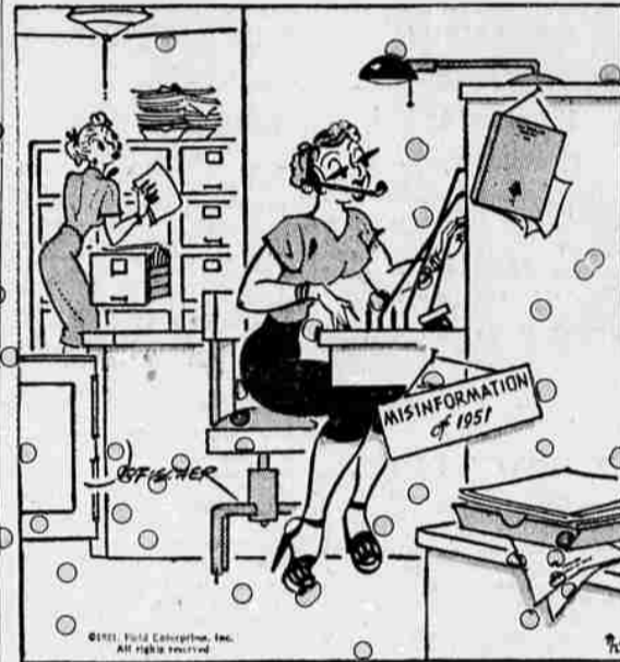
It's office routine, sir. You're supposed to give me your name and phone number so I can jot it down and forget it.