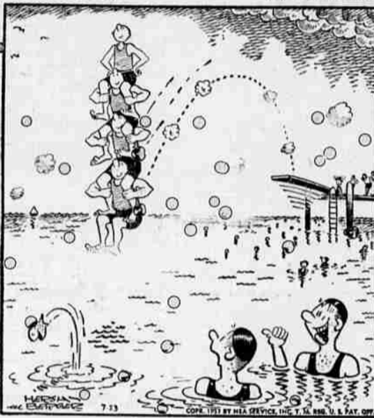
"It's the 'Jolly Rollers' acrobatic team taking a dip!"