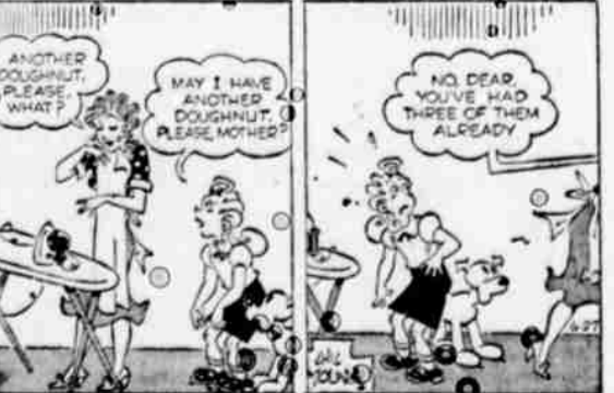
MAY I HAVE ANOTHER DOUGHNUT, PLEASE? MAY I HAVE ANOTHER DOUGHNUT, PLEASE, MOTHER?