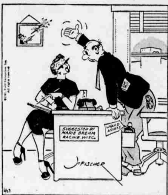
I AM paying attention, Mr. Wump. I didn't hear a word you said!