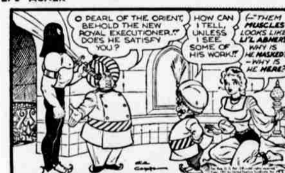
PEARL OF THE ORIENT BEHOLD THE NEW ROYAL EXECUTIONER! DOES HE SATISFY YOU?