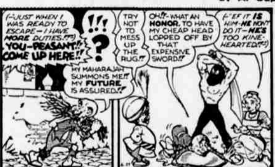
JUST WHEN I WAS READY TO ESCAPE—I HAVE MORE DUTIES! YOU—PEASANT! COME UP HERE!