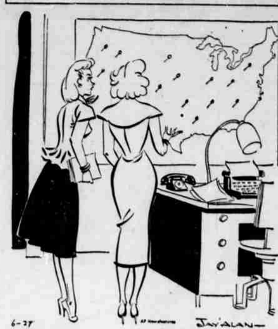
ISN'T OUR MR. MURDOCK SIMPLY DIVINE? I STAND HERE AND WATCH HIM THE WHOLE TIME HE'S ON THE ROAD!