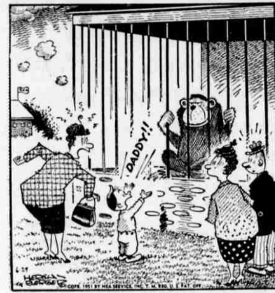
"Believe me, I'll know better than to call your father a 'big baboon' in front of you again!"