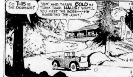
SO THIS IS THE DOINGS? YEP! AND THAT'S GOLD IN THEM THAR HALLS! WAIT! YOU MEET THE BOSS—HE INHERITED THE JOINT!