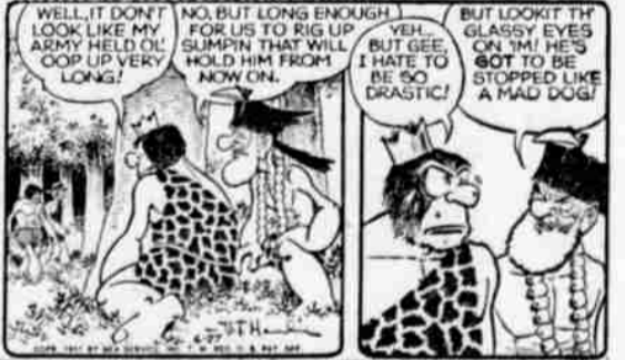
WELL, IT DON'T LOOK LIKE MY ARMY HELD UP COOP UP VERY LONG!