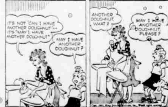
IT'S NOT CAN I HAVE ANOTHER DOUGHNUT? IT'S MAY I HAVE ANOTHER DOUGHNUT?