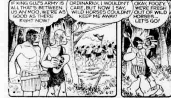
IF KING GUZ'S ARMY IS ALL THAT'S BETWEEN US AN' MOO, WE'RE AS GOOD AS THERE RIGHT NOW!