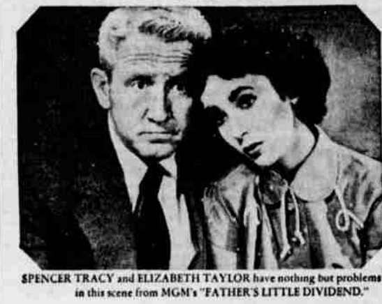
SPENCER TRACY and ELIZABETH TAYLOR have nothing but problems in this scene from MGM's "FATHER'S LITTLE DIVIDEND."

Sex Hygiene Ideas Bring Suspension Of Male Teacher