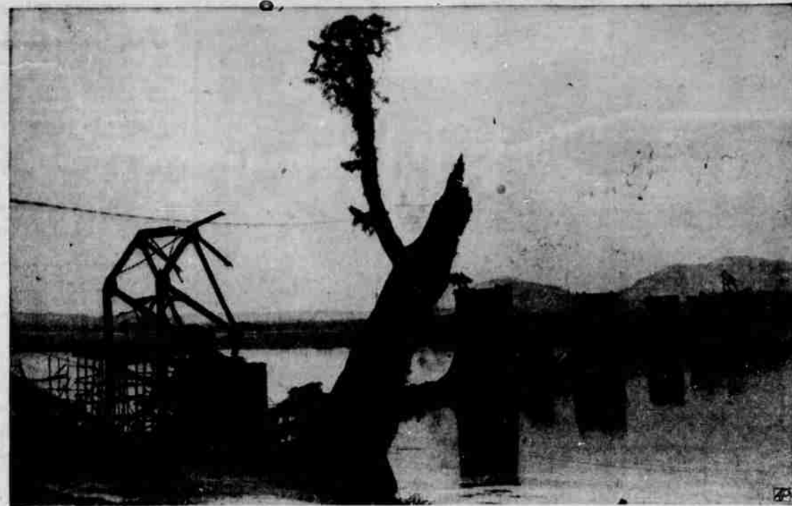
MUTE TESTIMONY TO FURY OF WAR - A shattered tree stands like a gaunt sentinel before the war-wrecked remains of a bridge over the Han River, a natural barrier on the western front in South Korea.