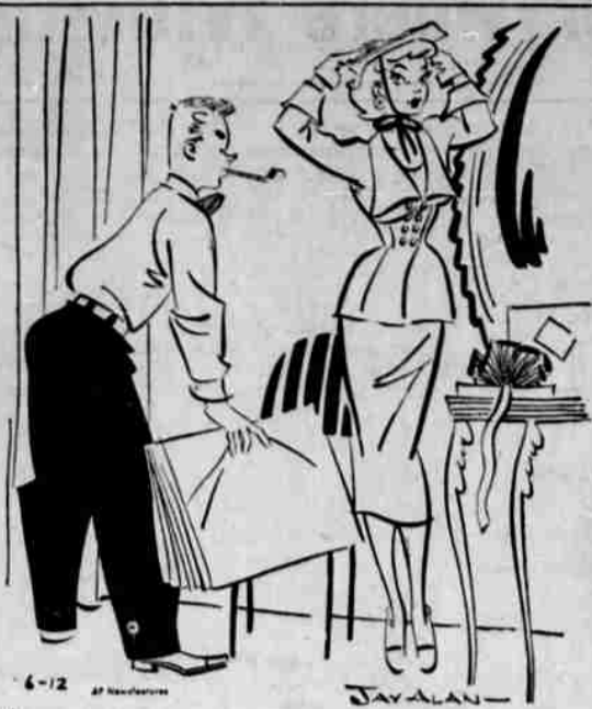
I DID NOT GET IT FOR TWENTY-FIVE CENTS AND A BOX TOP! IT IS A BOX TOP!