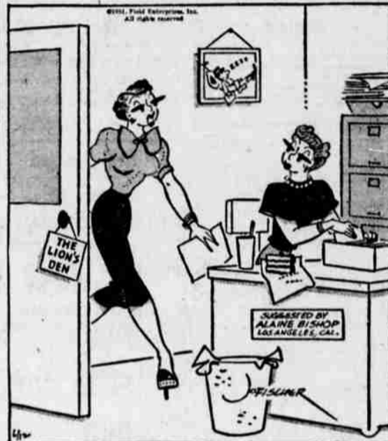
I've just been complimented or insulted. I won't know until I find a dictionary.