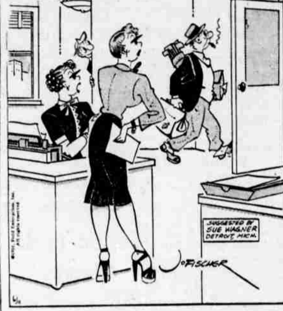
Of course Mr. Wump's business trips are important! It enables him to get out of town... and avoid work!