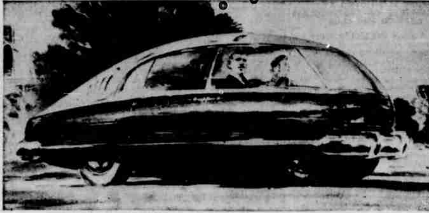
"TURBOCAR" IN YOUR FUTURE—This is what your "turbocar" of the future will look like, according to British jet expert G. Geoffrey Smith. The design promises greater visibility and more body space, thanks to the gas turbine power unit located over the rear axle.

The marine corps and army already are rotating their fighting troops.