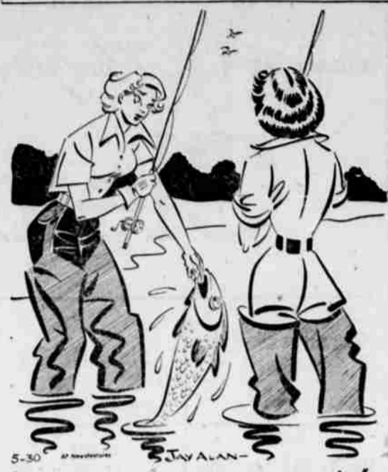
"OUCH!! THE FISH SURE ARE BITING TODAY!"