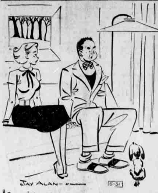
"COULDN'T WE GIVE HIM A QUARTER TO GO TO THE MOVIES OR SOMETHING?"