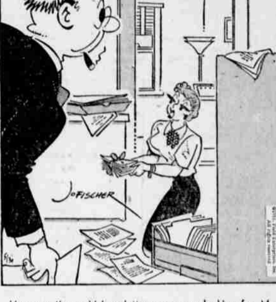
Here are those old love letters you were looking for, Mr. Wump. They were filed under "bad investments".