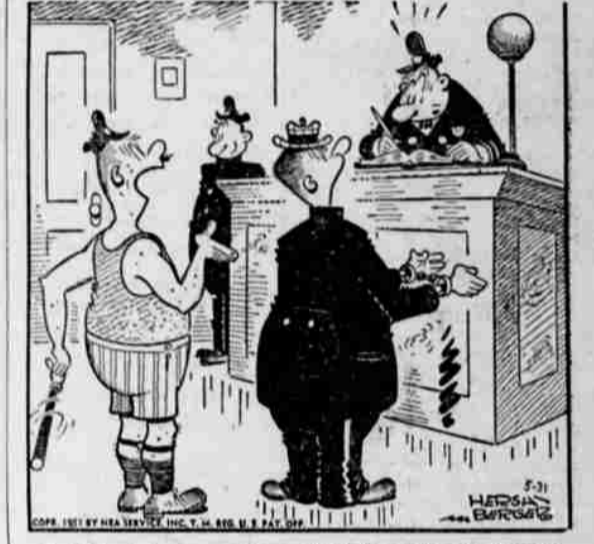
"I think he's a magician, chief—he stole my uniform before I could get him handcuffed!"