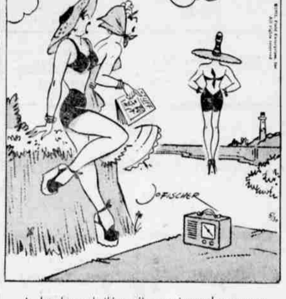
Anchovy's new bathing suit was a tremendous success. She's going to marry the policeman who arrested her.