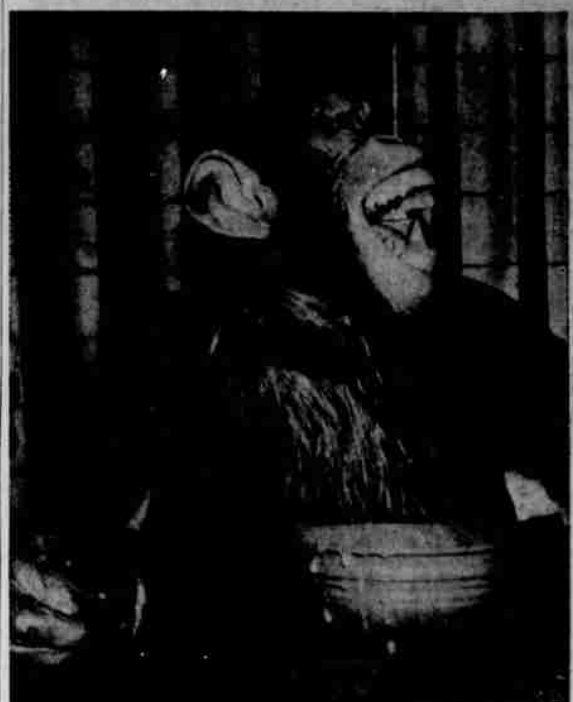
"ABBA DABBA GIMME"—If Apes talk that way, this joy-registering chimp would be saying "Holy Toledo! How long has this been going on? More, more, give me more!" His excitement resulted from his first taste of ice cream at the Cleveland, Ohio, zoo, where he's a popular resident.

"black markets, producer strikes and meat famines", then added: "It is difficult to believe that anyone could sacrifice a strong America to gain a temporary profit advantage. It is true that there were fewer cattle at the North Portland livestock market than usual on Monday. Regardless of the reason for this, it is the duty of all of us to hold the line on prices. "If the consumer will not pay more than the ceiling level of any commodity, including meat, there is no question that America can and will produce sufficient quantities to maintain our standard of living." Diamonds were mined in India in ancient times.