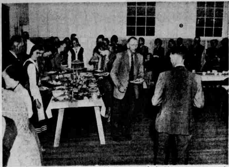
THE SMORGASBORD sponsored by Riversdale Grange as a fund raising event was a most delightful success of Saturday evening at the hall. The tables were beautifully decorated in blue and yellow. Large bouquets of spring flowers decorated the room. Swedish meal balls and baked salmon formed the main dishes with various salads, cheeses, relishes and Swedish breads on the menu. Five maids dressed in Swedish costumes served, while Scandinavian music entertained the guests. Following the dinner, pinocle and canasta were in play. Cards were furnished by courtesy of Kløver Radio company.