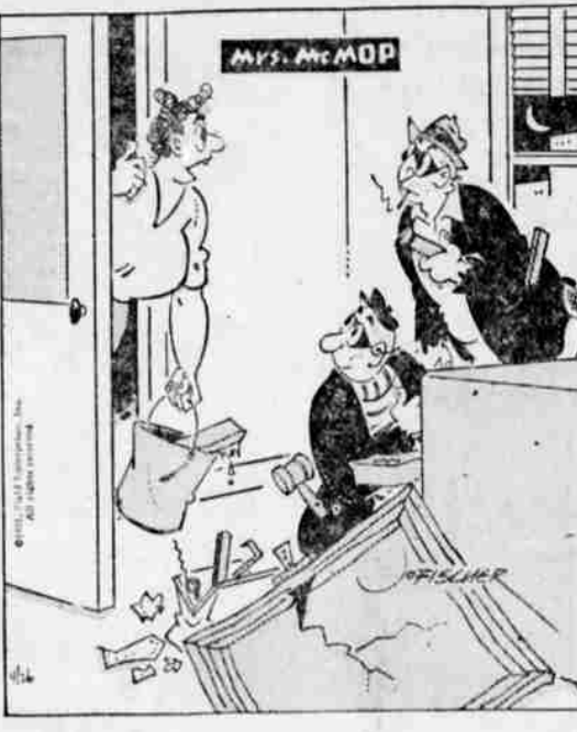
Be sure to lock up before you leave.