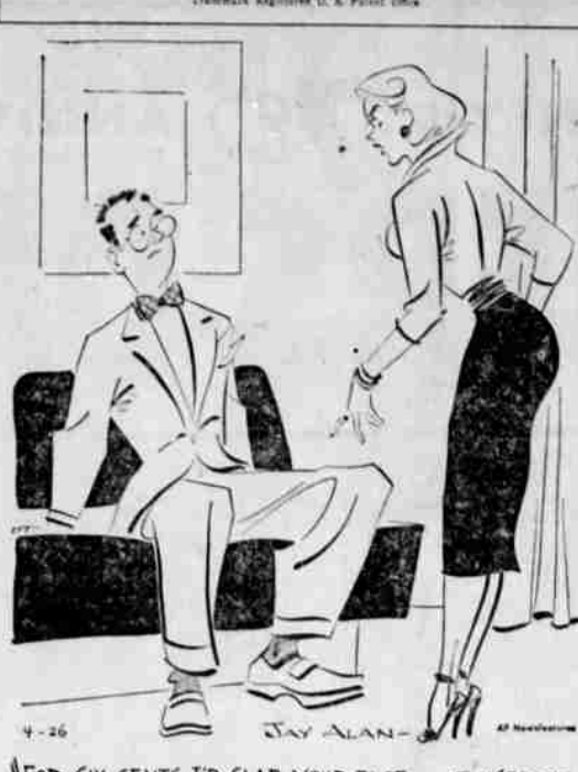
FOR SIX CENTS I'D GLAP YOUR FACE---IT USED TO BE TWO CENTS BUT EVERYTHING'S HIGHER THESE DAYS!