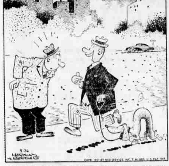
"He's a smart dog—figures he doesn't get so tired with a shorter wheelbase!"