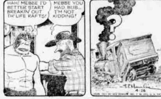
By Chic Young