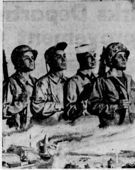
TRIBUTE TO THE G.I.'S—Here is a reproduction of the full-color painting being used by the Defense Department on the official poster for Armed Forces Day, May 19.

"New construction projects are just not being fed into the hopper to keep the work going," this ana-