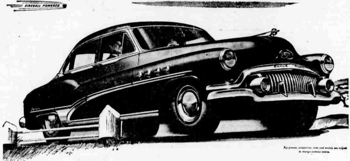
Equipment, accessories, trim and models are subject to change without notice.

IT started the day the 1951 ROADMASTER made its first appearance—and has been building up ever since.