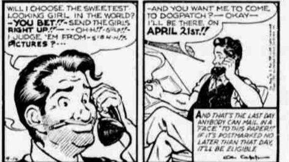
By Al Capp