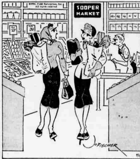
I can't understand it. After I cook my husband's favorite dishes, they aren't his favorites anymore.