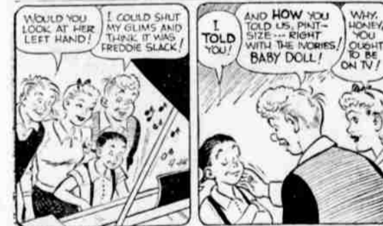
By Merrill Blosser