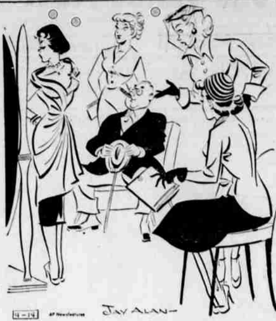
HER FATHER PICKS OUT ALL HER NEW DRESSES, HATS, AND HUSBANDS!