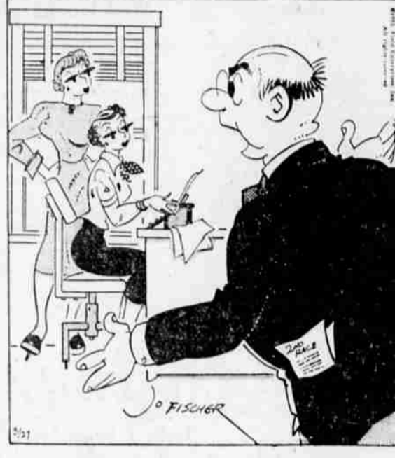
Will you girls please pay some attention . . . even if it's only to ignore me!