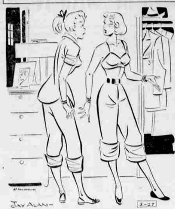
"I HAVEN'T A THING TO WEAR! ALL MY BROTHER'S SHIRTS ARE IN THE LAUNDRY!"