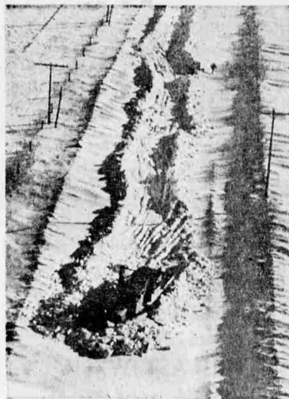
STOPPED COLD —The driver of this snow plow had to shovel his way out after his truck was stalled. Forty-mile winds and a snowfall of 18 to 24 inches stopped all traffic on Highway 6 east of Grinnell, Ia.