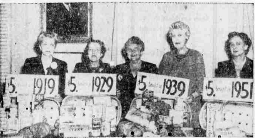
CONGRESSWOMEN SHOW DROP IN DOLLAR —Five Republican women members of the House of Representatives display these baskets of groceries in the House to point out loss of value of the dollar. They are (L to R): Representatives Marguerite S. Church (R-Ill.), Cecil M. Harden (R-Ind.), Frances P. Bolton (R-Ohio), Ruth Thompson (R-Mich.), Katherine St. George (R-N.Y.).