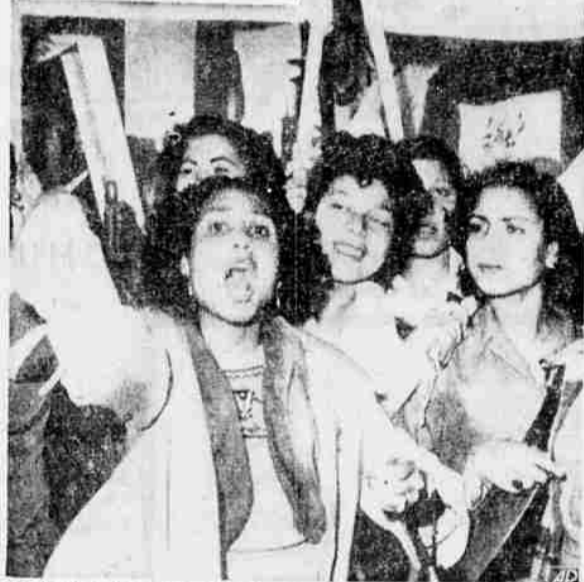
EGYPTIAN WOMEN SHOUT FOR RIGHTS —Carrying slogans and shouting, these women demonstrate at the gates of King Farouk's Abdin palace in Cairo. They submitted a request to the King claiming political rights for Egyptian women. At present women do not have the right to vote and only men can be appointed to any civil post.