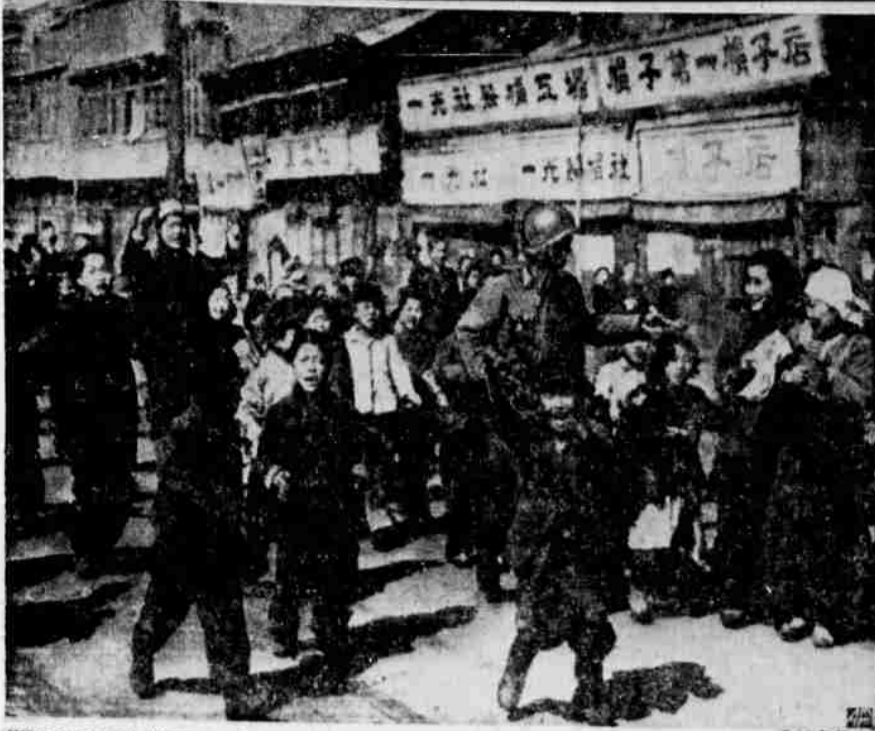
KIDS WILL BE KIDS —A cheering crowd of Korean children surround a Third division soldier in a Seoul street shortly after his platoon entered city. Reoccupation by U.N. troops marked fourth time the Republican capital has changed hands since war began June 25, 1950.

Sat., March 24, 1951—The News-Review, Roseburg, Ore.