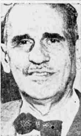
ACCUSED —Ramon Grau San Martin (above), former Cuban President, has been indicted for "principal responsibility" in what was alleged to be one of the greatest frauds in the history of Havana. San Martin has been accused of theft or misappropriation of 40 million dollars.