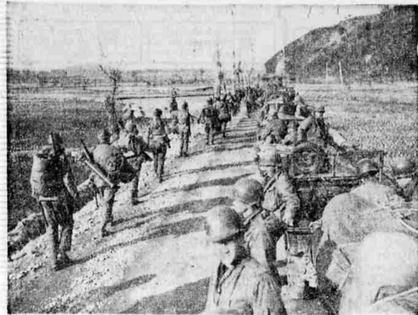
PUSHING THE REDS BEFORE THEM —Infantry troops of the 1st Cavalry pass a vehicle convoy as they move up a road about 18 miles south of the 38th parallel in the Honuchon area. United Nations forces, doggedly pushing the Reds back across the parallel, have established "holding positions" within 17 miles of the line at five points along the 140-mile front.