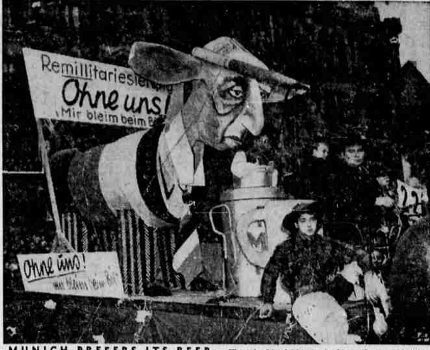
MUNICH PREFERS ITS BEER — Float in Munich's carnival parade carried this slogan: "Remilitarization without us. We hold to the beer." Parade publicized German opposition to rearmament. Title of this float, one of 96 in three-mile parade was "Leave us out."