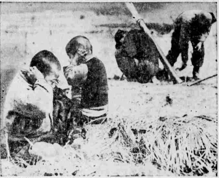
OLD TIMERS AT THIS CAME-Acting like combat veterans, these Korean children cover their mostar is fired by U. S. soldiers at the Red enemy in Korea, (U. S. Army photo from NEA-Acme.)