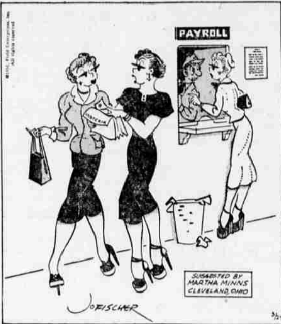
This has been one of my good weeks. I broke one finger nail, ruined two pairs of hose, and was fired by the boss only three times.