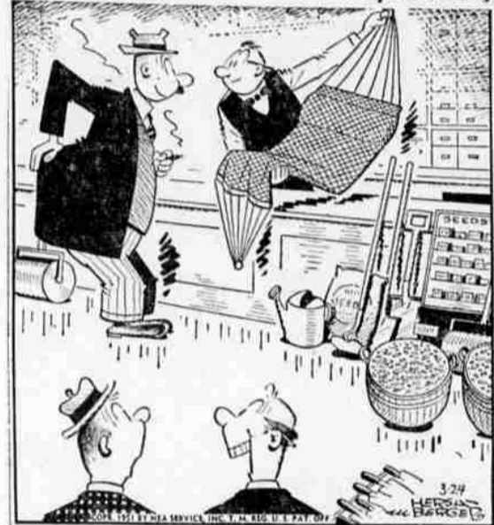
"Joe's quite a gardener—he always buys a hammock first!"