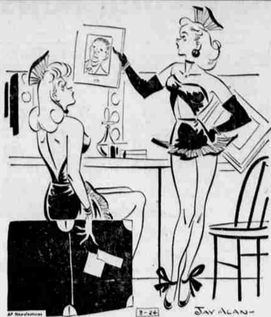
Now this one doesn't have any money but he speaks four languages—French, Spanish, Swedish and baby talk!