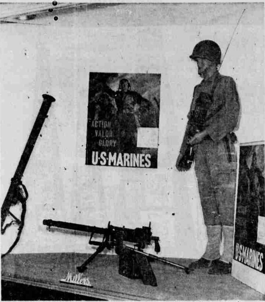
MARINE CORPS DISPLAY —To encourage marine corps recruiting and interest in the motion picture "Halls of Montezuma," opening Wednesday at the Indian theater, the Miller's department store on Jackson street has placed the above display in its store window. The display shows a marine in uniform with typical battle equipment.