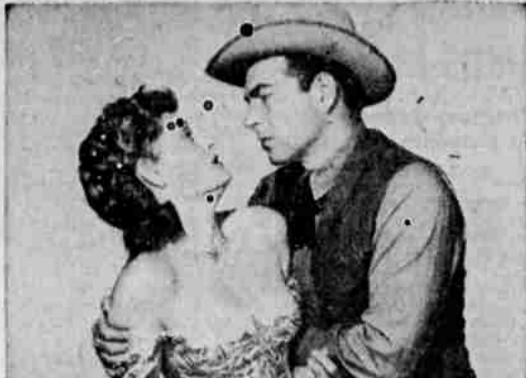
ALEXIS SMITH and STEPHEN McNALLY in a dramatic scene from Universal-International's "WYOMING MAIL," in color by Technicolor.