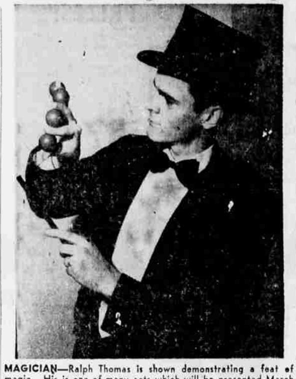
magic. His is one of many acts which will be presented March 21 when the Young Oregonian talent show appears at Roseburg

Long Island is the largest island in continental United States with 1,723 square miles.