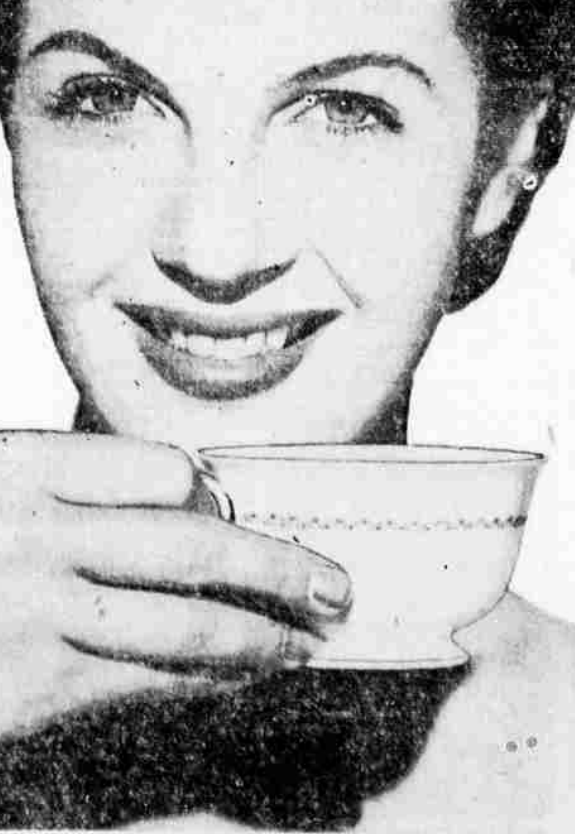
GORINNE CALVET co-starring in "Quebec," a Paramount Picture, color by Technicolor

It's true. You can't make a bad cup of M.J.B. And millions of people, including 163 famous movie stars, who use it daily can tell you why. No matter how you brew coffee . . . strong, in-between, mild . . . M.J.B will have exactly the pure delicious coffee flavor you want.