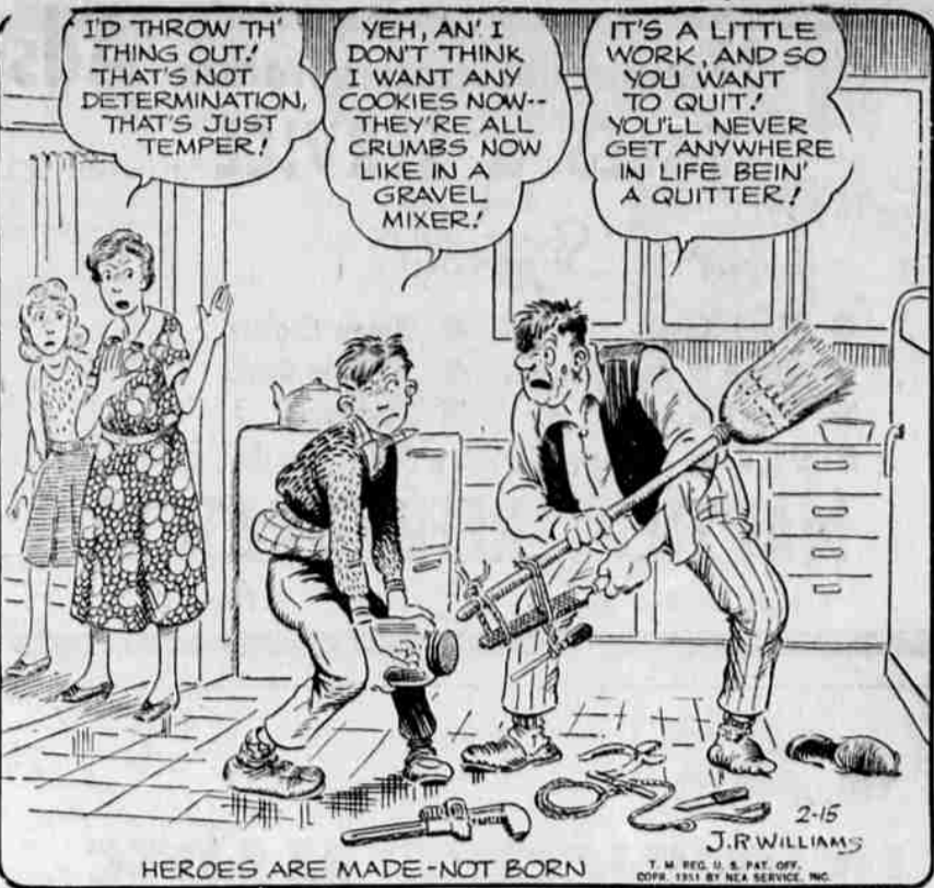
HEROES ARE MADE—NOT BORN