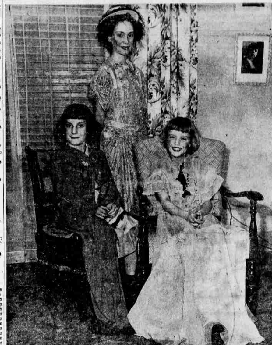
THREE SEDATE (FOR THE TIME BEING) young ladies, all dressed up (except here and there) in their Sunday best, made a social call upon a lady of their acquaintance and in their own neighborhood Sunday.

They commented upon the weather, which was threatening rain; primly discussed the best methods of preparing French dressing and politely inquired concerning the health of their hostess, which was none too good.