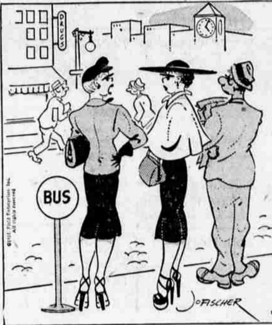
My boss and I work beautifully together. He can't remember everything... and I can't remember anything.