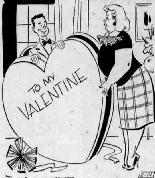
"Oh it's just you, Henry! I thought it was a big box of candy!"

Trademark Registered U. S. Patent Office