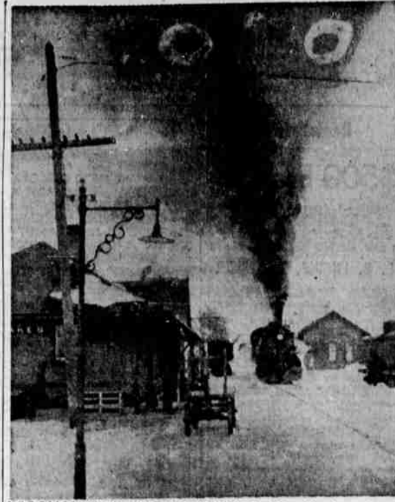
LOCOMOTIVE BLOWS SMOKE RINGS —This Northern Pacific railway locomotive was blowing smoke rings as it pulled into Oakes, N.D., during a recent cold wave. A slight wind blew them forward so they were not broken up by the smoke from the stack. J. W. Enger of Oakes, who took the photograph, said the lighter color of the rings is due to the vapor and steam in the puffs from the engine.