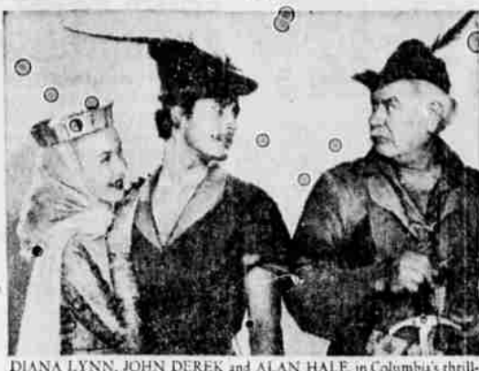
DIANA LYNN, JOHN DEREK and ALAN HALE, in Columbia's thrilling "ROGUES OF SHERWOOD FOREST," in color by Technicolor.

shalled 14,500 troops and police to enforce a ban against it. Some 5,000 demonstrators turned out in Paris.