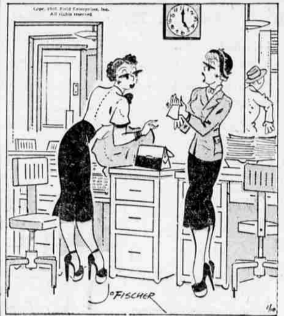
My... this day went almost as quickly as if I'd stayed home.