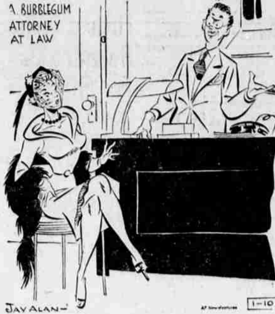
A BURLESCUE ATTORNEY AT LAW I MUST ADMIT YOU DON'T HAVE MUCH OF A CASE BUT I WOULDN'T SAY YOU HAVEN'T A LEG TO STAND ON!