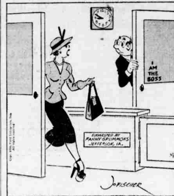
"I'm awfully sorry I'm early this morning, Mr. Wump. I under slept."