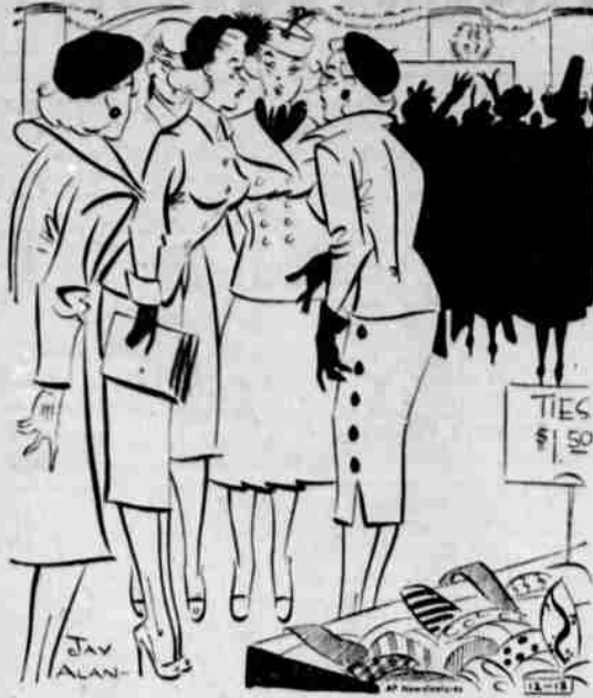
"WE'LL USE THE TWO PLATOON SYSTEM, THREE OF YOU PUSH TO THE COUNTER ON DEFENSE AND WE'LL FOLLOW ON THE OFFENSE."