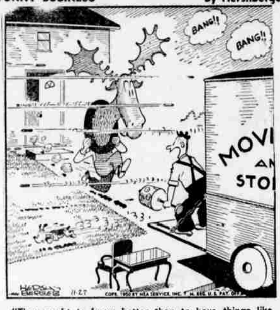
"They ought to know better than to have things like this moved in open season!"