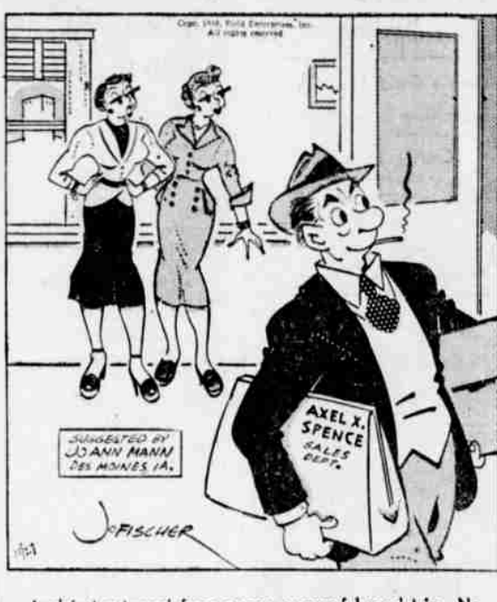
Axel just returned from a very successful road trip. No orders... but he turned in his biggest expense account.