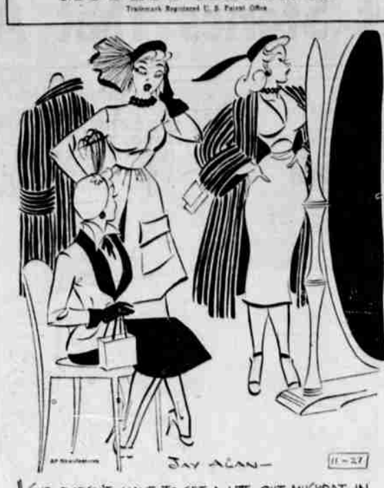
HE DOESN'T HAVE TO GET A LET-OUT MUSKRAT IN ORDER TO LOOK LIKE A MINX!!